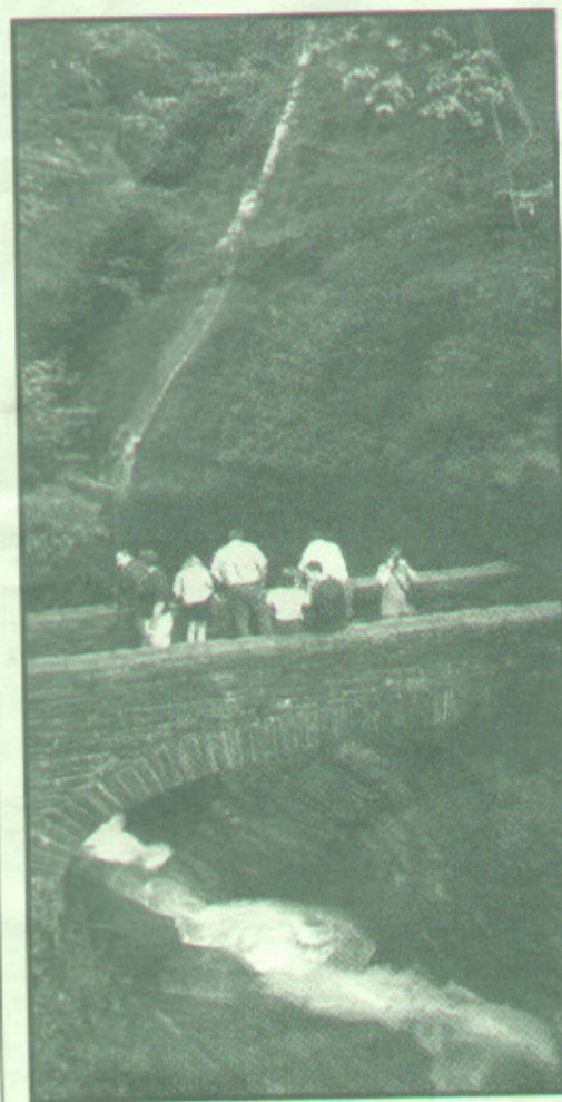
Watkins Glen, New York