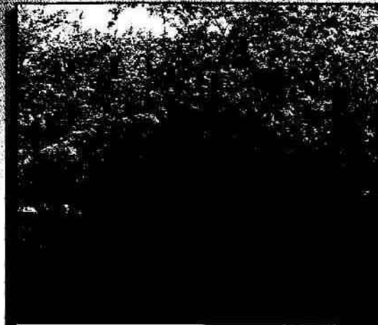
The crabapple trees at the Naturealm put on their colorful show from late April through mid-May.