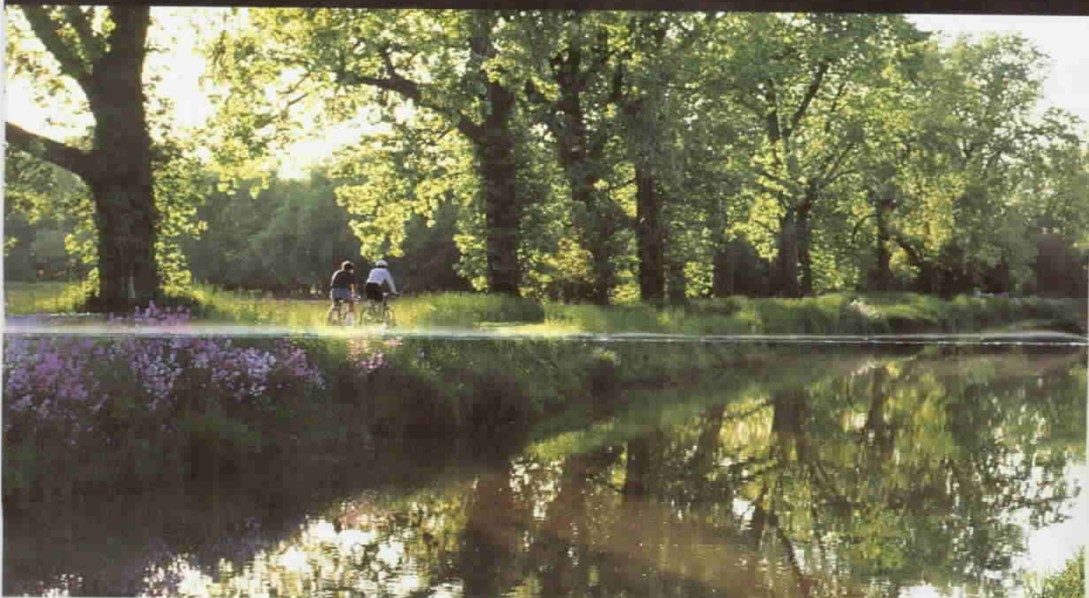
Ohio & Erie Canal Towpath Trail