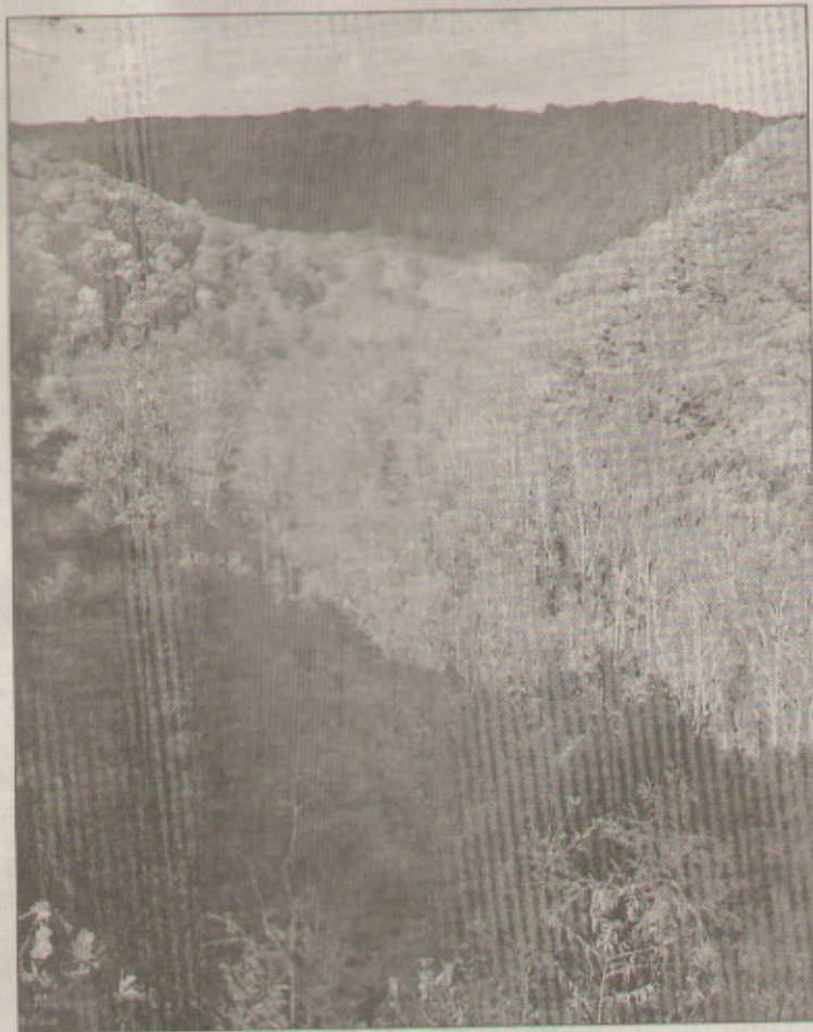
The new mountain bike trail on the north ridge will give you a high view into the Clearfork Gorge.

The western terminus is near the group campground off Ashland County Road 939 near