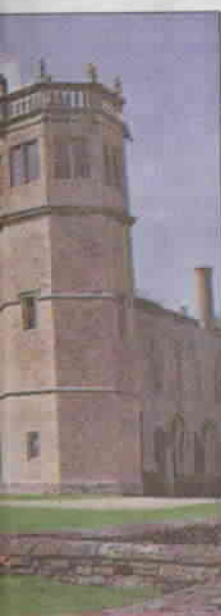
England's Lacock the 13th century.